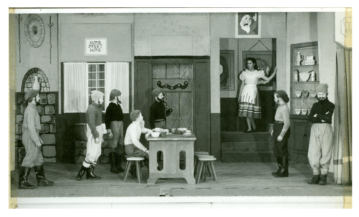
Worle Senior School panto. Snow White and the Seven Dwarfs. 1953