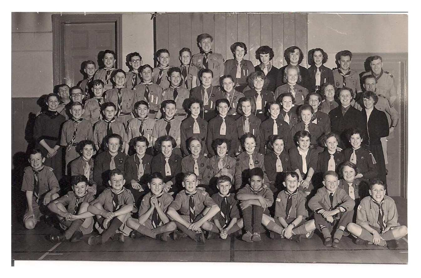
Scouts' Christmas Party. Church Hall 1950s