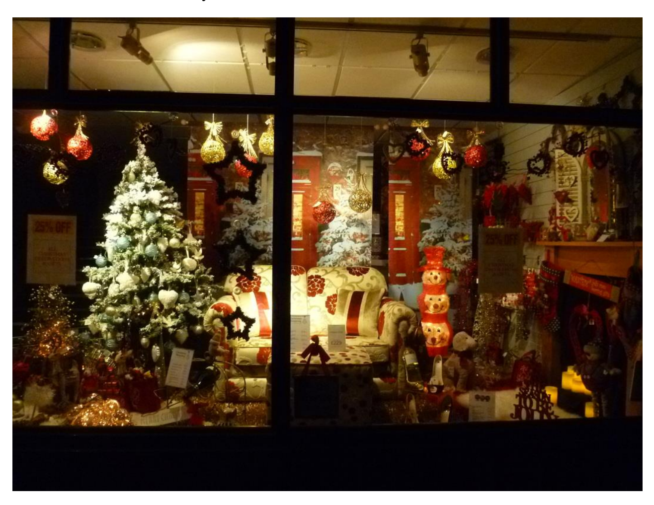
Skidmore's Christmas window 2014, I think