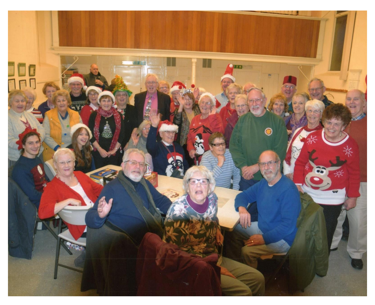
Worle History Society Christmas Quiz 2017