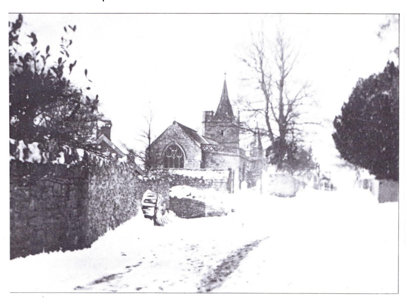
St Martins in the winter of 1962/63