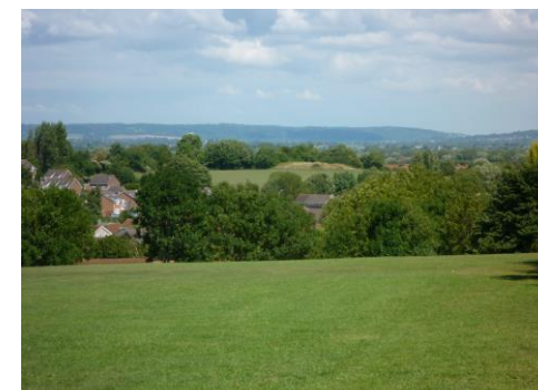
View from Lynch Farm to Castle Batch, 2010